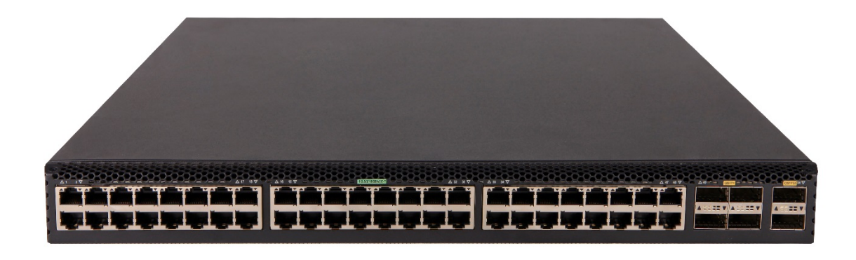
HPE FlexFabric 5710 48XGT 6QSFP+ or 2QSFP28 Switch (JL586A)