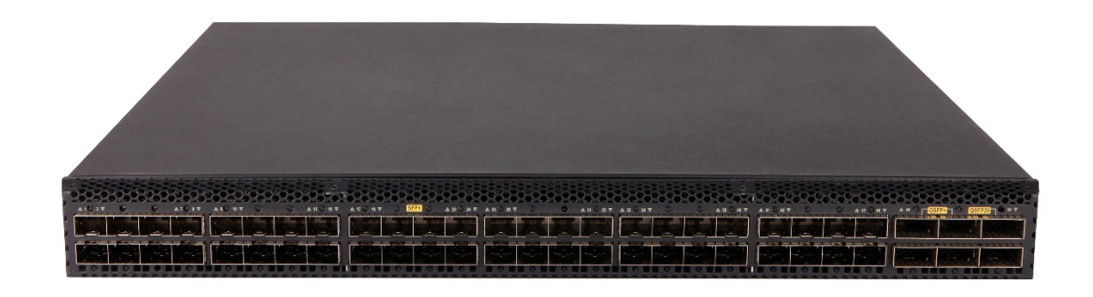
HPE FlexFabric 5710 48SFP+ 6QSFP+ or 2QSFP28 Switch (JL585A)