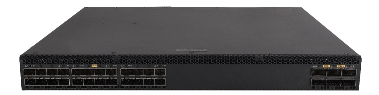
HPE FlexFabric 5710 24SFP+ 6QSFP+ or 2QSFP28 Switch (JL587A)